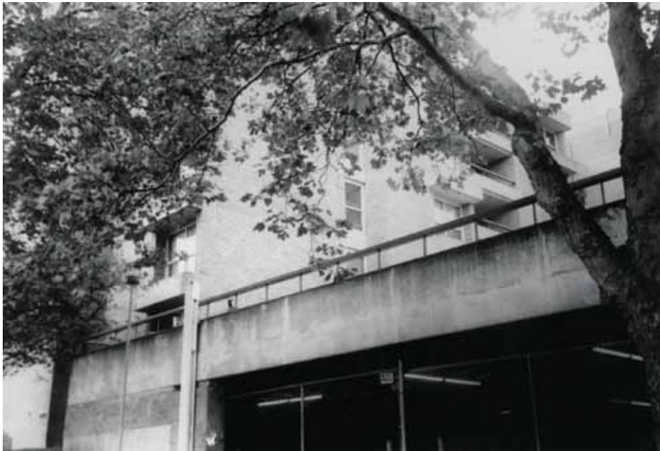
Veronica Ramirez { Beginning B&W Student }